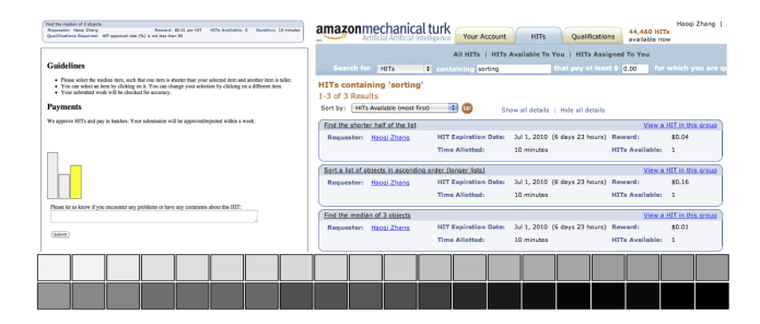
Figure 2. Snapshot of TurkSort, showing a pivot task [left], the Mechanical Turk page listing the sorting subroutines available to workers [right], and a (mostly correct) sorted list of tiles by grayscale [bottom].

To highlight opportunities within the first two subareas, we shall focus on examples drawn from classic computational problems studied in algorithms and AI, which, by being well-defined and well-studied, help to illustrate methods for engaging a crowd to perform more general computational solution procedures. For the third subarea, we describe an example of how humans can help break down a goal into a plan of execution.